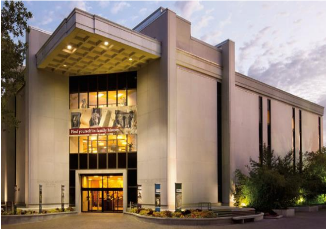
Family History Library