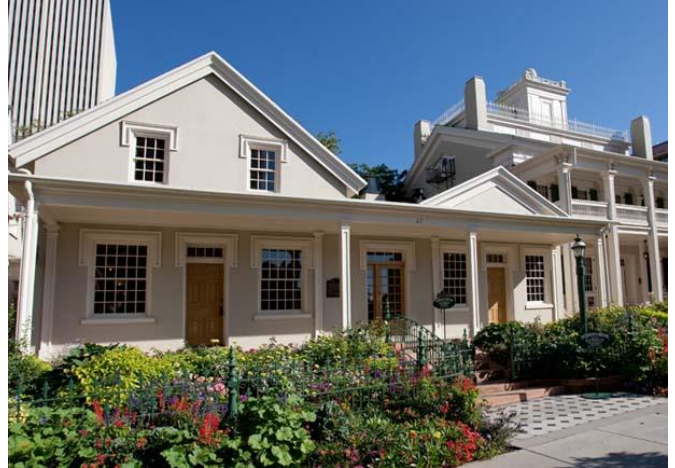
Beehive and Lion Houses